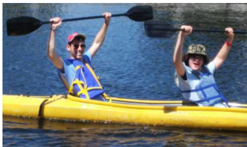
Children at Risk

With so many Campers, three buses were required for field trips. This had the added benefit of campers being able to go to different locations regardless of which group they were normally with. Outings included Go Karting, mini golf and driving range at Karter's Korner's; exploration of mazes, sprinkler fun or pillow bouncing at Saunders Farm; Train ride through the corn field and tractor climbing as well as checking out the animals at Valleyview Little Farm; Water park rides and slides at Mont Cascades; play structures and water park fun at Brewer Park; paddle boating, kayaking and canoeing at Dows Lake and a small group of the older campers were treated to a boat ride along the canal down to the NAC and back. We were extremely lucky with the weather, but on the one week where rain interfered with trips, the older Campers went to the Museum of Nature and watched an IMAX movie called Tiny Giants and younger campers had a great time at Cosmic Adventures. Camp came to an end with all campers being invited to attend the Arnprior Fair for rides, petting zoo and a hot dog lunch with live entertainment.