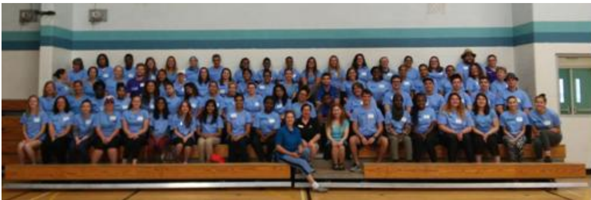
CAMP KALEIDOSCOPE 2015 Staff Photo