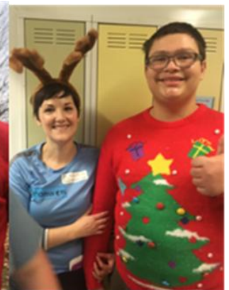
Christmas spirit - 2 nd December session.

Despite the large number of Clubbers, all 6 Saturday Fun Clubs ran smoothly with lots of fun being had. The large numbers were really only noticeable with how crowded the registration area was with all the parents dropping off and at the 3 p.m. pick-up time.