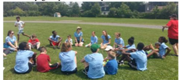
Two Groups getting together for a game of Duck, Duck, Goose.

The Campers ranged in age from 4 years to 23 years with a record number of 4 and 5 year old campers attending. Our largest number of Campers is in the Mid age range of 8 to 12 years followed by the Teenagers, then the Kids age range and a few that have been with us for many years going into their twenties. The number of girls attending continues to grow with 28 attending which allowed for multiple Girls only groups for multiple weeks.