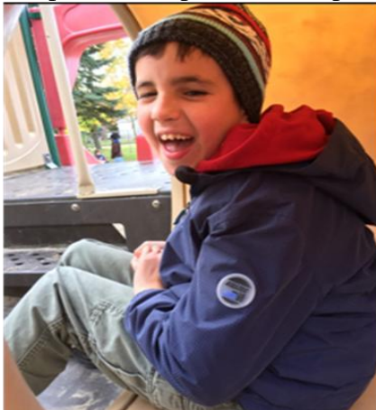
Fun on the play structures at the park

Activities include but are not limited to: Gym games, outside play, baking, mad science, arts & crafts, scavenger hunts or other challenge activities. Each group is divided into age and functionality with a schedule of activities organized by a Group Leader. The program is organized and managed by the same staff as operate Camp Kaleidoscope.