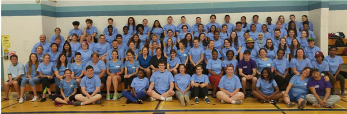
103 of the 120 Children At Risk personnel involved in the execution of 2017's Camp Kaleidoscope day camp.

2017 saw Camp Kaleidoscope return to the East end of the city and to Lester B Pearson High School for our 5 weeks of summer day camp. A few things had changed since we were last on the school premises reducing the number of group rooms available to us and the Staff room was being renovated necessitating the stage to be set-up as a break room. Regardless, we were excited to be back as the location has the distinct advantage of being walking distance from the Gloucester wave pool.