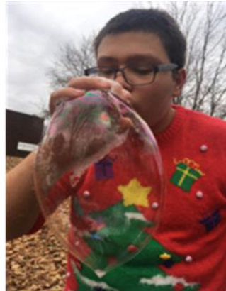
Making Unbreakable bubbles

As always not everyone is available every session including Group Leaders so we had a number of the Group 2nd's from Camp K try their hand at being in charge and also made some promotions for returning staff who only work at Saturday Fun Clubs.