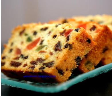
GUM DROP FRUIT CAKE

For those who do NOT like regular Fruit Cake is this delightful treat with Gumdrops instead! Also avoids nuts for those with allergies!