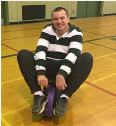
Never too big to enjoy the plasma cars in the gym

Just in case you are not aware of what Saturday Fun Club is, it is a program of fun activities for the Clubbers from 10 a.m. to 3 p.m. and an opportunity for some well deserved respite for parents. It takes place at our office location at 235 Donald Street one to two Saturdays a month.