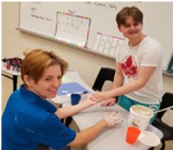
Having a hand treatment as part of the Teen Girls Group Spa Day

Cooking was a big part of the camps programming. Each group gained access to the kitchen twice a week having both a morning slot and an afternoon slot. Those attending in the morning would make something they could have for a late breakfast such as pancakes or waffles or to supplement or replace their packed lunch. Menu items included Pigs in a blanket, mini pizzas, quesadillas, wraps, pasta with a tomato sauce, chicken risotto.