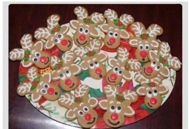
BRILLIANT!!!! An upside down gingerbread man = Reindeer!