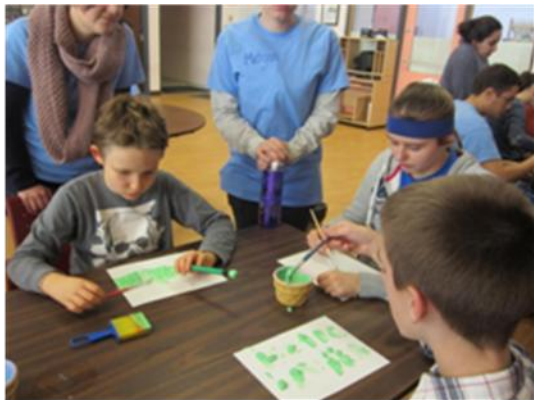
Shaving Cream Painting

The Fall of 2014, saw the third year of Saturday Fun Club and we were fortunate to have many of the new staff that joined us at Camp Kaleidoscope be part of the Saturday Fun Club staff! With the Clubber numbers into 30-35 (and rising) we have been fortunate that we have also had many new staff come on board. Many are experienced and others are looking to gain experience as want to work in the fields of Special Education or children health and well being. Regardless they all have to be willing to have fun! We hear “We couldn’t do that in the school board” but that’s the point, it isn’t school, it’s a “Fun” Club on a Saturday!