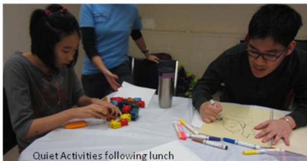
Quiet Activities following lunch

We want every child to have the same opportunities for fun and games as their neurotypical peers, we just make sure there are ample supports to make the Clubber as successful as possible.